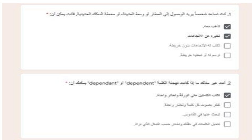
Fig. 3. Screenshot of the student respond

In order to calculate reliability and validity of learning styles questionnaire. The researchers selected a pilot sample consisted of 20 students to take part in testing the reliability of the questionnaire, Alpha coefficient was used to calculate the reliability of the questionnaire as revealed in the following table (2).