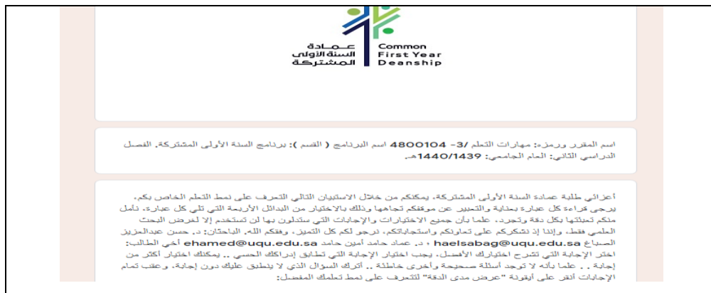
Fig. 1. The main interface of VARK Questionnaire