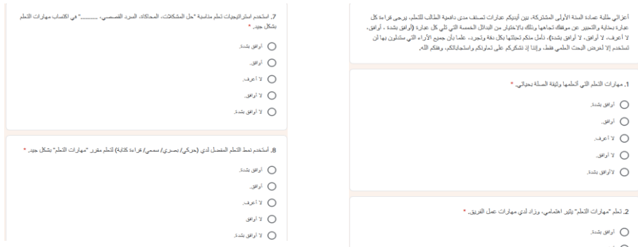
Fig. 4. Screenshots of the learning motivation questionnaire

On the other hand, the internal validity coefficient was computed by using Pearson coefficient. The correlation coefficient was valued as ( r = 0.71 ). It was significant at level (0.01), thus it referred to a high internal consistency of the learning motivation scale which ensured the questionnaire validity.